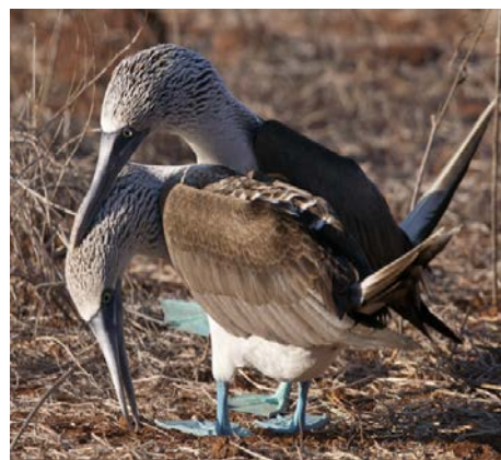
Blue-footed boobies to

You'll enjoy the last landing site teeming with wildlife and wander past many breeding blue-footed boobies and a large colony of magnificent frigatebirds. Hopefully you'll find males of both species in full display, the boobies sky-pointing and showing off their bright blue feet as they dance and the frigates calling for females with their wings spread wide and their dramatic red throat pouches inflated – an unforgettable sight! You also have the chance to see Galápagos sea lions, marine iguanas, striated herons, brown noddies, swallow-tailed gulls, and lava gulls. The endemic palo santo and low, bushy prickly pear cacti add great scenery to the amazing abundance of Galápagos wildlife. You'll reluctantly depart for Baltra and bid farewell to the Samba and its crew. Juan Manuel will escort you the airport for your return flight and overnight stay in Quito.