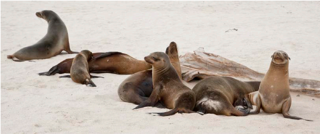
Galápagos sea lions