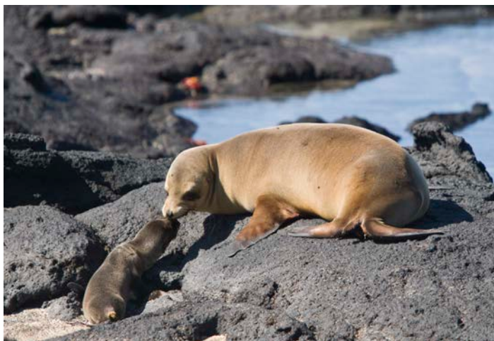
Galápagos fur seals

The small yet incredible island of South Plaza is your afternoon destination. This beautiful island is home to many land and marine iguanas. The colorful landscape is covered with reds and greens of Portulaca that may have yellow flowers that the iguanas enjoy eating. In the giant prickly pear cactus you can compare the cactus finch alongside small and medium ground finches. At the top of the island bachelor sea lions escape from the competition of stronger males as red-billed tropicbirds fly gracefully by.