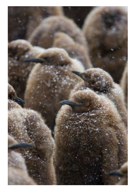
King Penguin Oakum Boys

During this time of year, king penguins will be far from the only attraction at St. Andrews. The southern elephant seal, the world's largest seal, gathers here by the thousands creating one of the densest concentrations of life on the planet. Expect to see