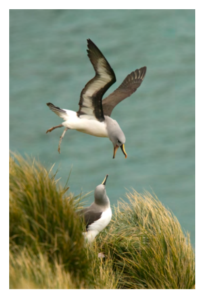
Gray-headed Albatross

abiding by the Guidelines for Responsible Ecotourism from the International Association of Antarctica Tour Operators (IAATO).