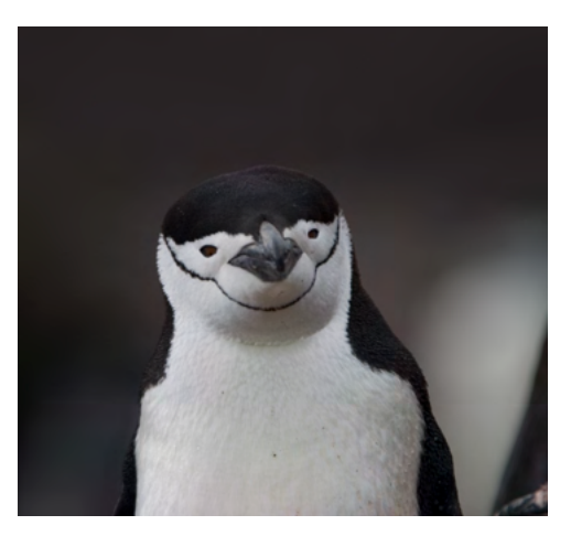
Chinstrap Penguin

On a clear day, the chinstrap penguins of Half Moon Island make a delightful foreground to the breathtaking coastline of nearby Livingston Island . At this end of the Earth, the vast scale of nature will open our senses and we ask you to give great respect to the fragile vegetation and the wildlife colonies.