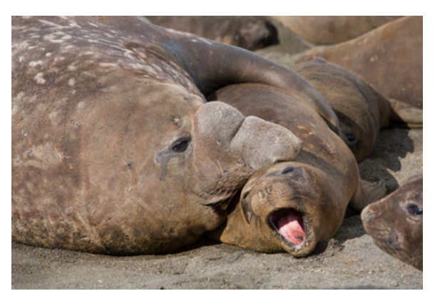
Southern Elephant Seals

Shackleton, Crean, and Worsley were very near the end of their dramatic and perilous self-rescue when they stumbled down into Fortuna Bay from the interior of the island. They had just one short hike remaining, a westward walk of about three miles to Stromness Harbour to reunite with civilization after over 17 months in the Antarctic. You'll retrace their trek over a 300-meter ridge with a stunning view across the König Glacier down to Stromness's rusting inactive whaling station to reunite with the ship.