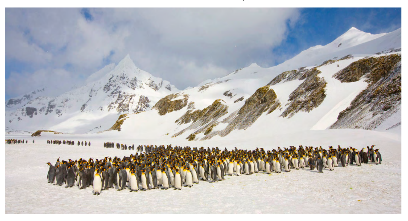
King Penguin Colony