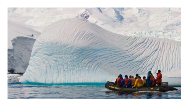
Zodiac Cruising among Icebergs

often hauled out on the ice floes and whales may even surface between the floes, so keep your cameras ready! Tall, hanging ice cliffs, the fronts of highly fractured tidewater glaciers, decorate most of the shoreline for unforgettable scenery. At the southern part of the Lemaire Channel you'll arrive at Petermann Island . Located at 65°S, Petermann is outstanding for seeing gentoo and Adélie penguins making feeding trips in large groups along a snow-filled penguin highway to and from their nests. The clear water is beautiful for observing and photographing penguin activities.