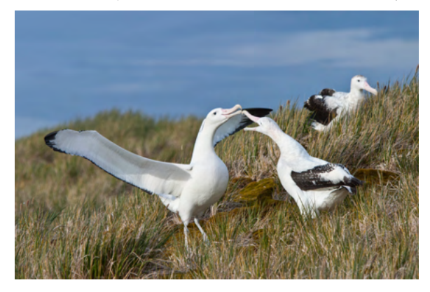
Wandering Albatross

You arrive just before the young, overwintering wandering albatross fledge, starting years of seafaring life before finally returning as young adults to breed. Each pair of albatross has a private