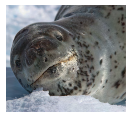
Leopard Seal

Weather and ice distributions will determine whether we travel south down the west coast or sail east through the Antarctic Sound into the Weddell Sea ; happily, you have ample time for a thorough exploration of the Antarctic Peninsula. When heading south, travel along the picturesque Danco Coast on the west coast of Graham Land . This area has awe-inspiring scenery with coastlines deeply indented with bays and scattered with islands. Impressive mountains rise sharply from the coast to the central Graham Land Plateau and glaciers descend to narrow piedmont ice shelves. Extensive Zodiac cruising and landings during the best