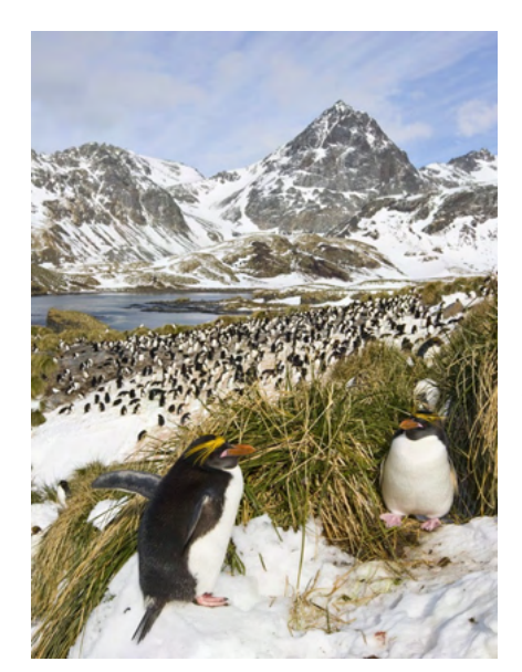
Macaroni Penguins

colony here and on Cooper Island due to a 2004 outbreak of avian cholera, and the colony will probably still be closed to landings. Cooper Bay sits just inside from Cooper Island, a rat-free island that is extremely important breeding habitat for burrow-nesting seabirds and South Georgia pipits.