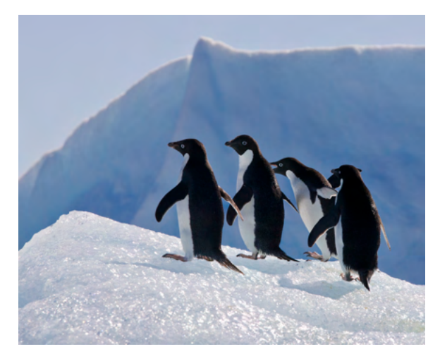
Adelie Penguins

These are a string of volcanic islands, some still active, that run parallel to the Antarctic Peninsula across the Bransfield Strait . Fondly known as the "Banana Belt of Antarctica," these islands boast the richest concentrations of terrestrial wildlife in the Antarctic because of their proximity to the rich upwelling waters from the great Circumpolar Current. Even with our luxuriously in-depth itinerary, we will have to choose between many very compelling sites.